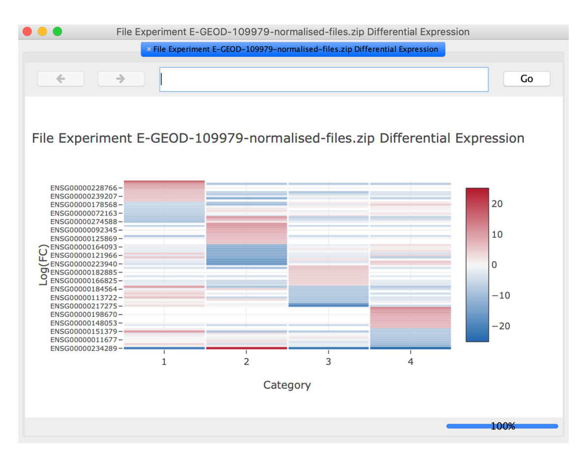
Figure 5. The heatmap for the top differentially expressed genes is displayed in a pop-up window and can be explored interactively. Note that the illustration shows results obtained from analysis with the default settings.