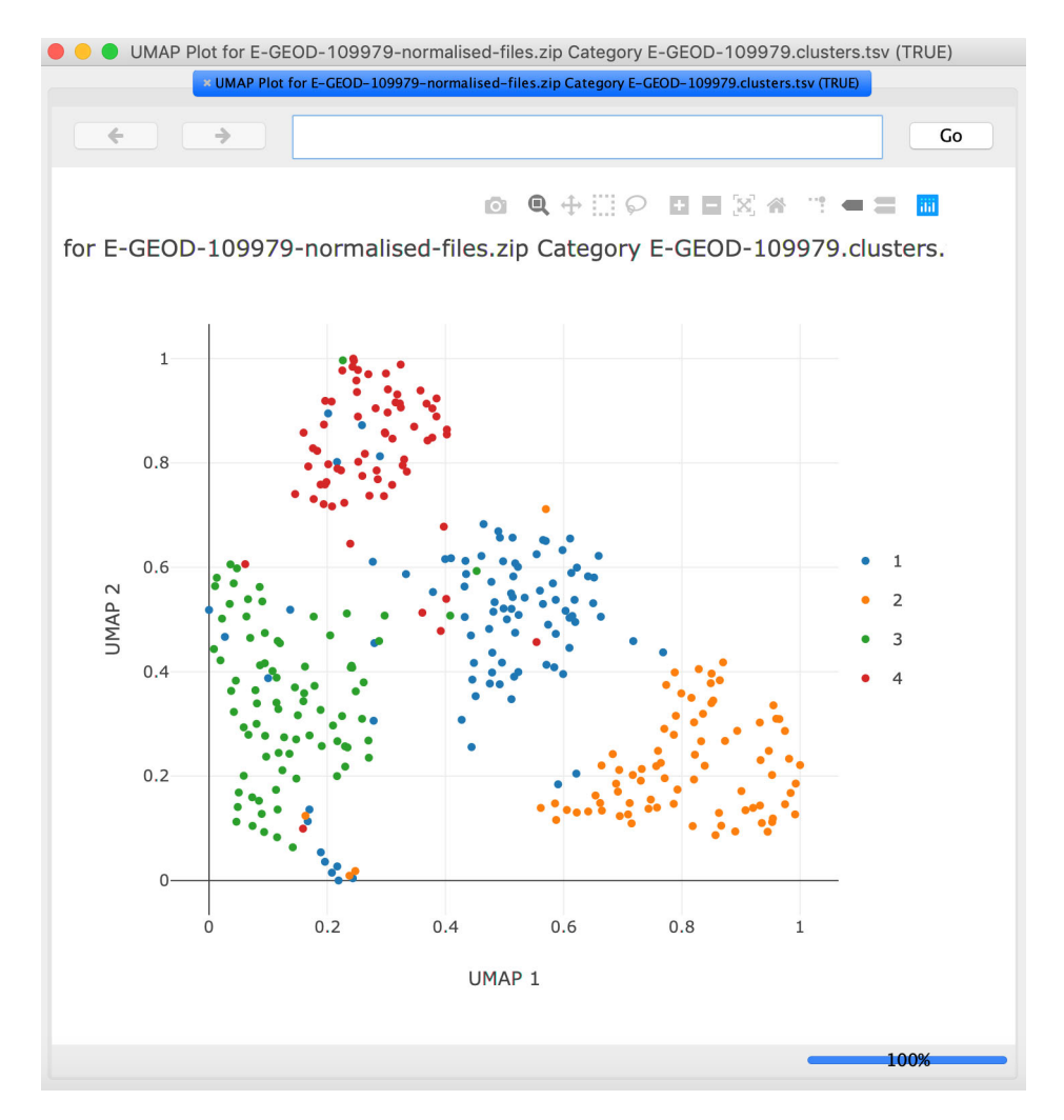
Figure 4. The UMAP plot is displayed in a pop-up window and can be explored interactively. Each dot is a cell, and coloring is by cluster number. Note that the illustration shows results obtained from analysis with the default settings.